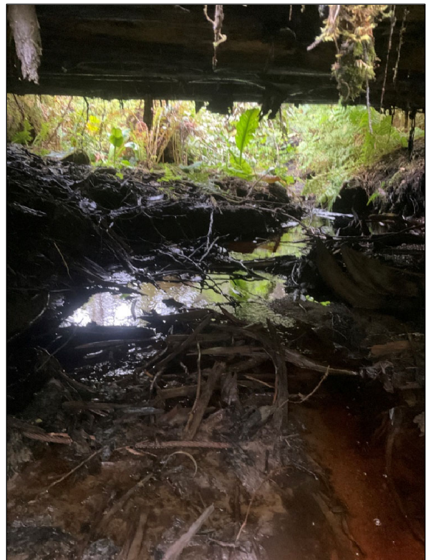
Figure 3.—Channel underneath log-stringer bridge at waypoint 1695.