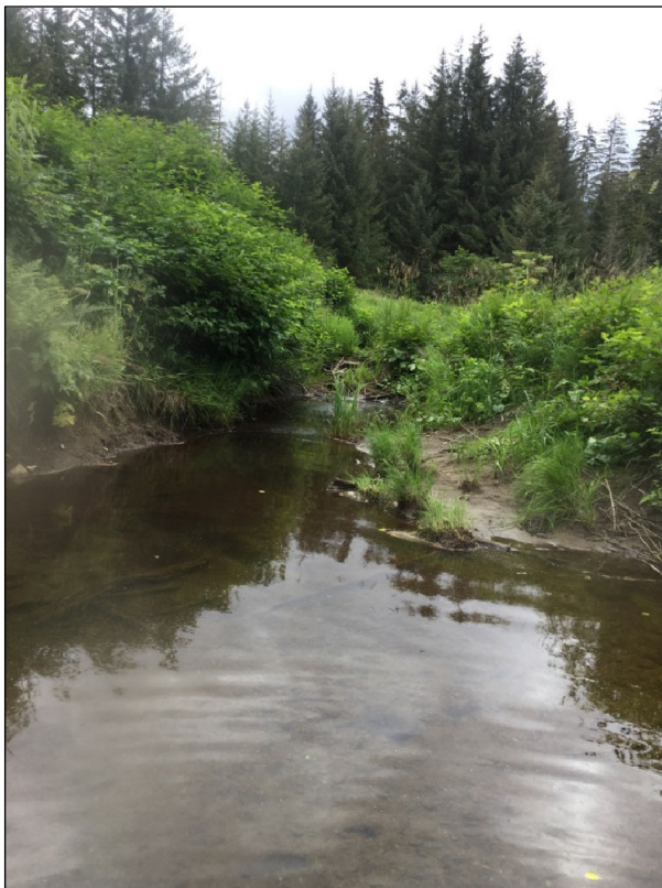
Figure 2.—Confluence of tributary 1 and Stream No. 114-31-10130 at waypoint 1058.