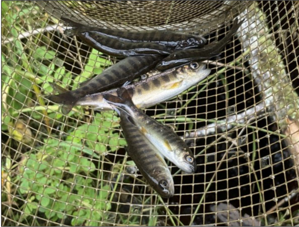
Figure 1.—Juvenile coho salmon captured at waypoint 1695.